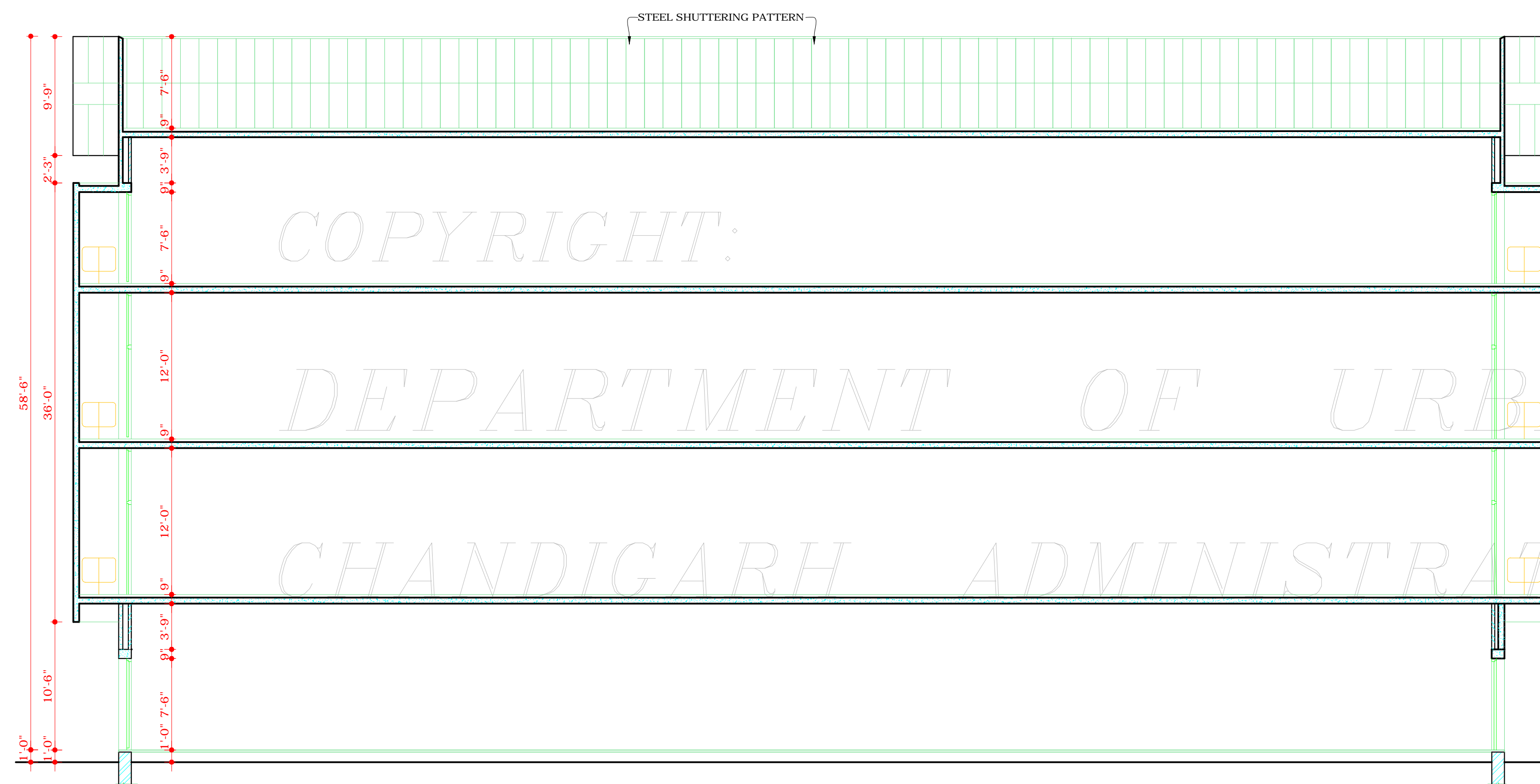
SECTION AT 'A-A'